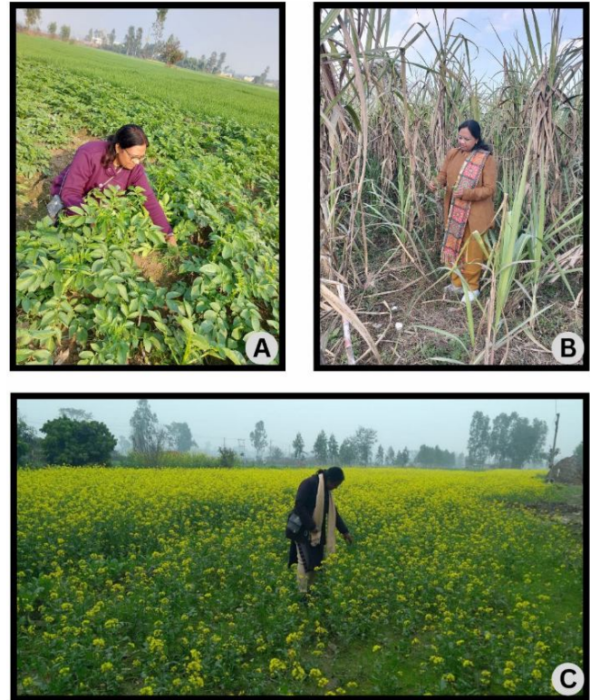
Fig. 1: Collection of weeds from various crop fields, A- Vegetable, B- Sugarcane, C- Mustard

maholiya, Jhankat, Sainjana, Keval Ganj, Dineshpur, Patrampur, etc. The collected weeds were identified with the help of floras and other relevant literature (Duthie 1903-1929; Osmaston 1927; Babu 1977, Pant 1986; Uniyal et al. , 2007; Naidu, 2012; Puslakar and Srivastava, 2018). Botanical names and families were checked and updated by POWO (Plants of the World Online) database.