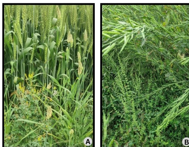
Fig. 3: Occurrence of different weeds in crop fields. A- Wheat, B- Mustard